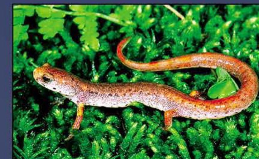
Four-toed Salamander ( Hemidactylium scutatum )