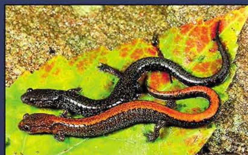
Eastern Red-backed Salamander ( Plethodon cinereus )