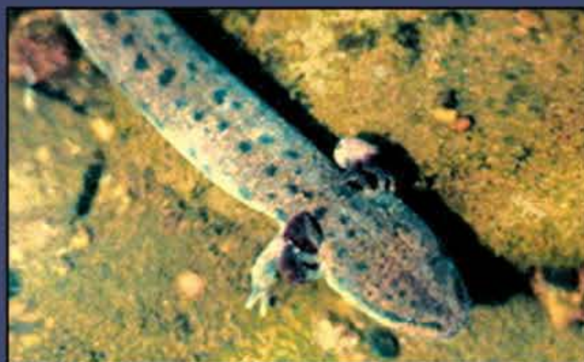
*Common Mudpuppy +++ ( Necturus maculosus maculosus )