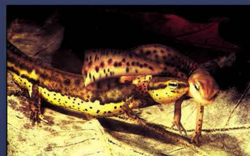
Red-spotted Newt ( Notophthalmus viridescens viridescens )