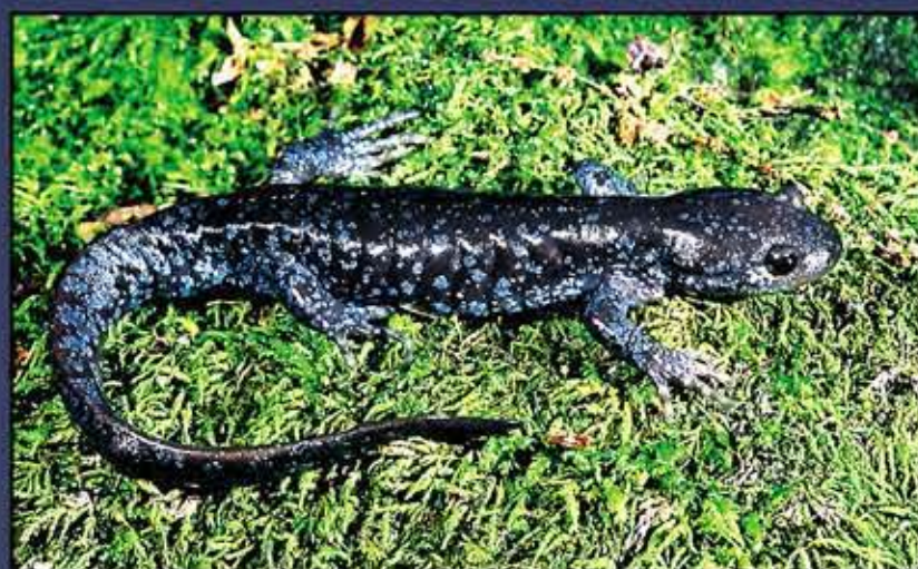
Jefferson Salamander + ( Ambystoma jeffersonianum )