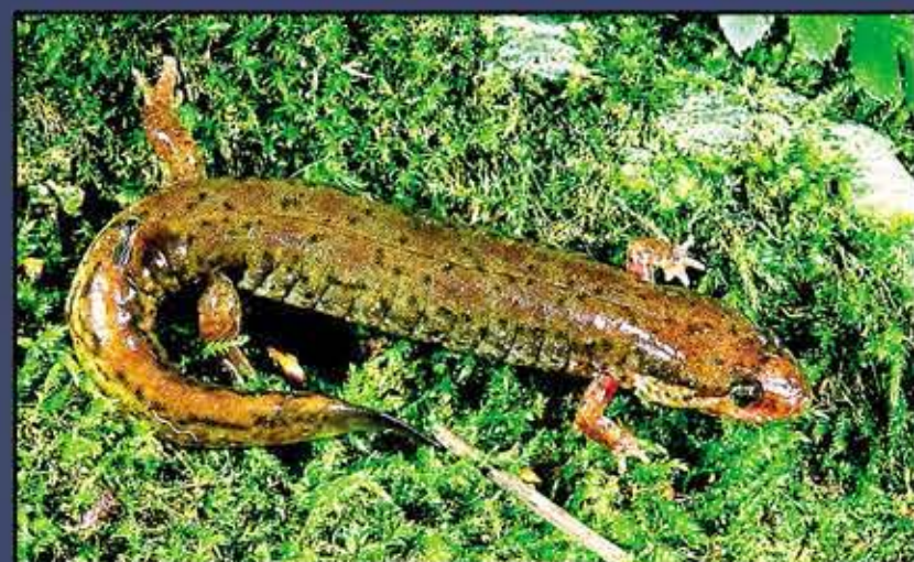
Northern Dusky Salamander ( Desmognathus fuscus )