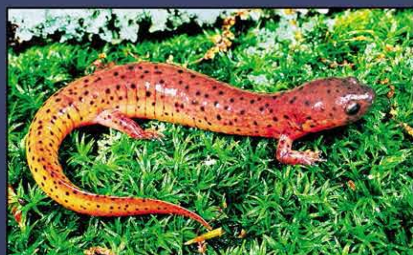
Eastern Mud Salamander ( Pseudotriton montanus montanus )