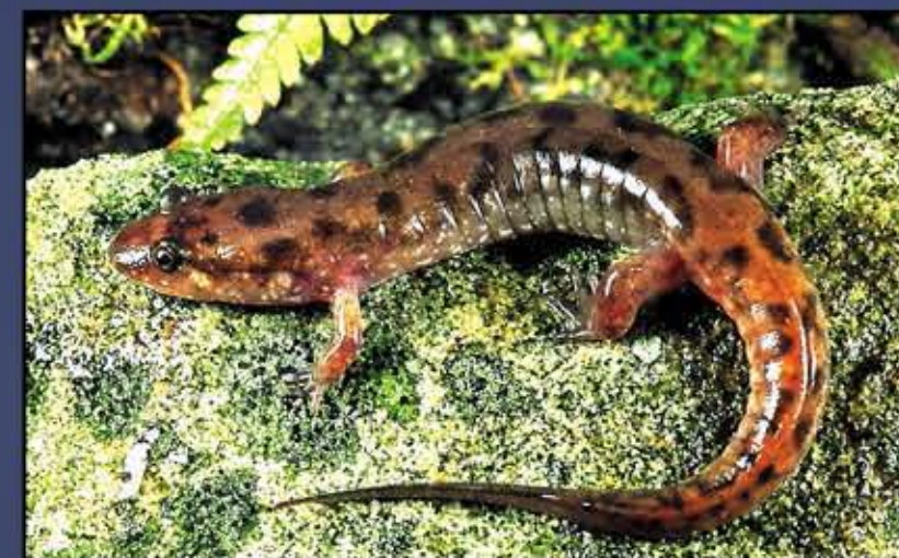
Seal Salamander ( Desmognathus monticola )