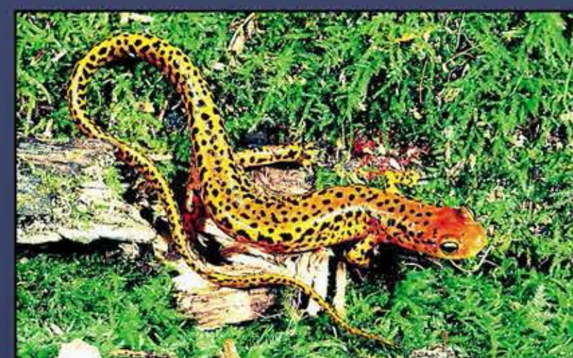
Long-tailed Salamander ( Eurycea longicauda longicauda )