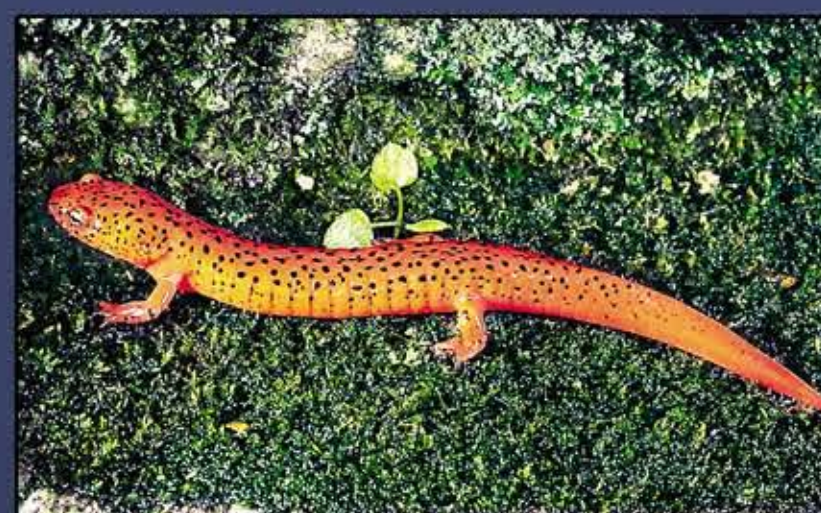
Northern Red Salamander ( Pseudotriton ruber ruber )