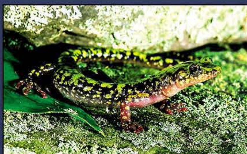
Green Salamander +++ ( Aneides aeneus )