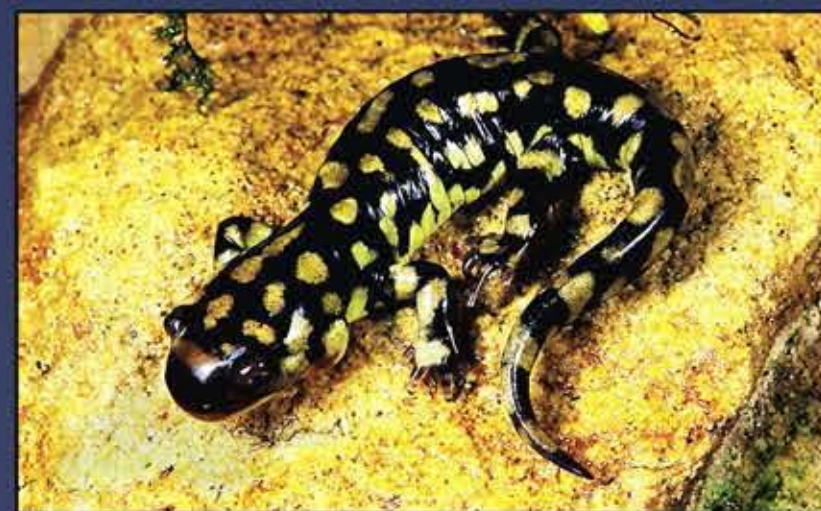
Eastern Tiger Salamander +++ ( Ambystoma tigrinum tigrinum )