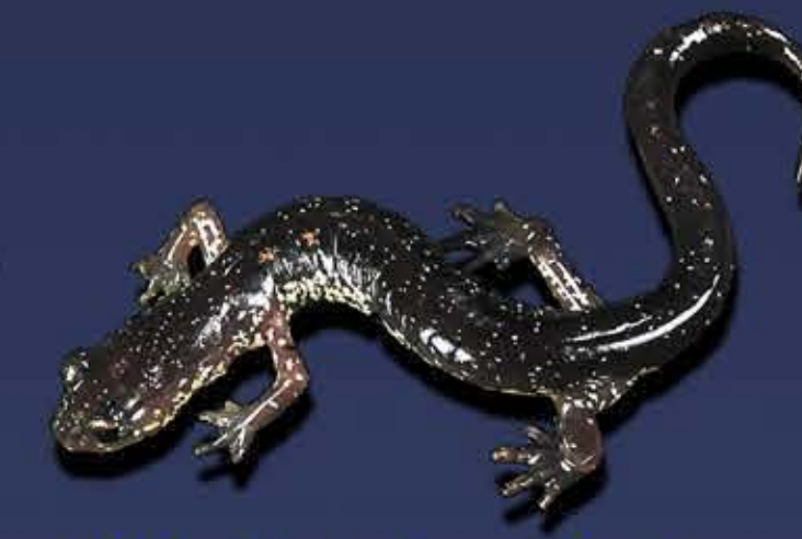
Wehrle's Salamander ++ ( Plethodon wehrlei )