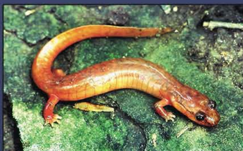
Northern Spring Salamander ( Gyrinophilus porphyriticus prophyriticus )