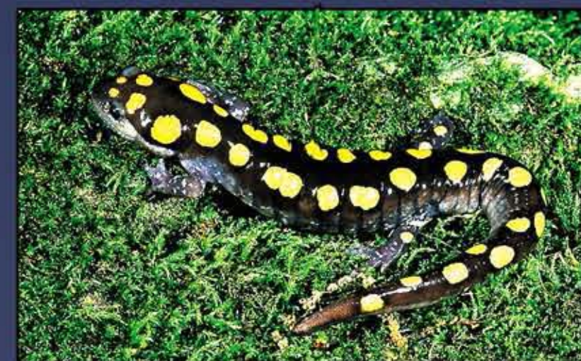
Spotted Salamander ( Ambystoma maculatum )