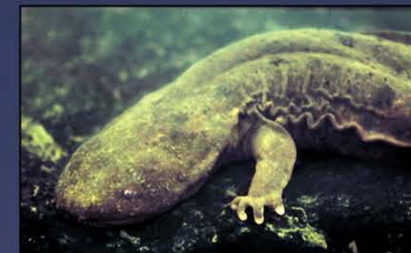
Eastern Hellbender +++ ( Cryptobranchus alleganiensis alleganiensis )