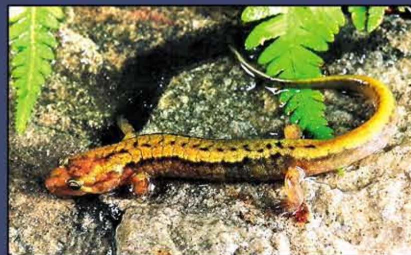
Allegheny Mountain Dusky Salamander ( Desmognathus ochrophaeus )