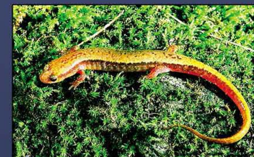
Northern Two-lined Salamander ( Eurycea bislineata )