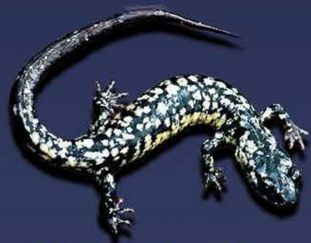
Northern Slimy Salamander ( Plethodon glutinosus )