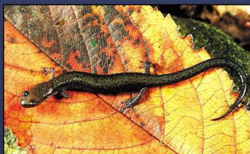
Valley and Ridge Salamander ( Plethodon hoffmani )